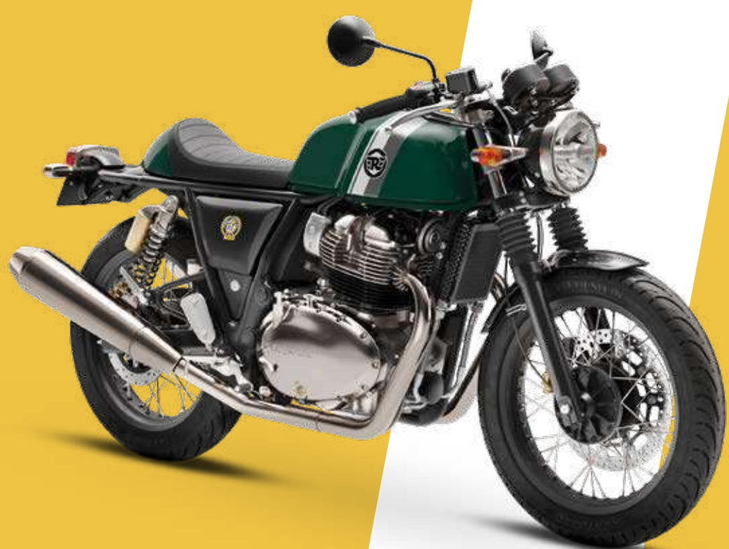
BRITISH RACING GREEN